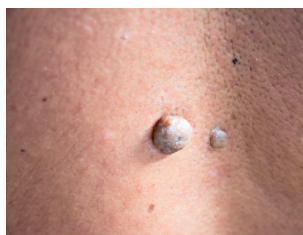
Skin tag / Acrochordon

With CryoPen sufficient power is available since liquified nitrous oxide freezes at a temperature of -89^{\circ}\text{C} . The application is accurate to the millimeter..